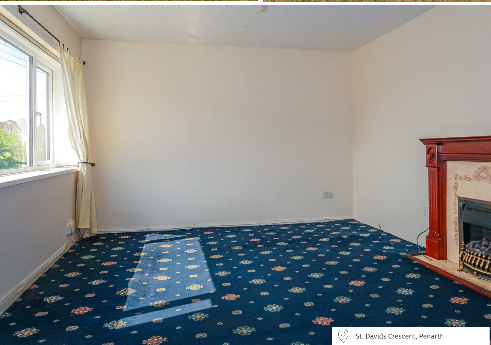
St. Davids Crescent, Penarth